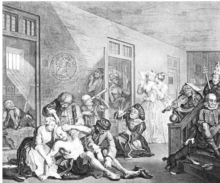
CH01-05: A Rake's Progress Scene in Bedlam. The engraving by William Hogarth (1697–1764) is of the interior of the Bethlehem Hospital in London known as “bedlam.”

Below is the final scene of Hogarth's A Rake's Progress series, 1735. There is an image of a man holding his head in the historical pose of the maniac. The fallen hero was ruined by drink, gambling, and women of ill-repute, and he is surrounded by other insane patients. An attendant attaches chains to his legs while his faithful lover cries. The well-dressed lady in the background is a visitor come to enjoy the antics of the Bedlam inmates.