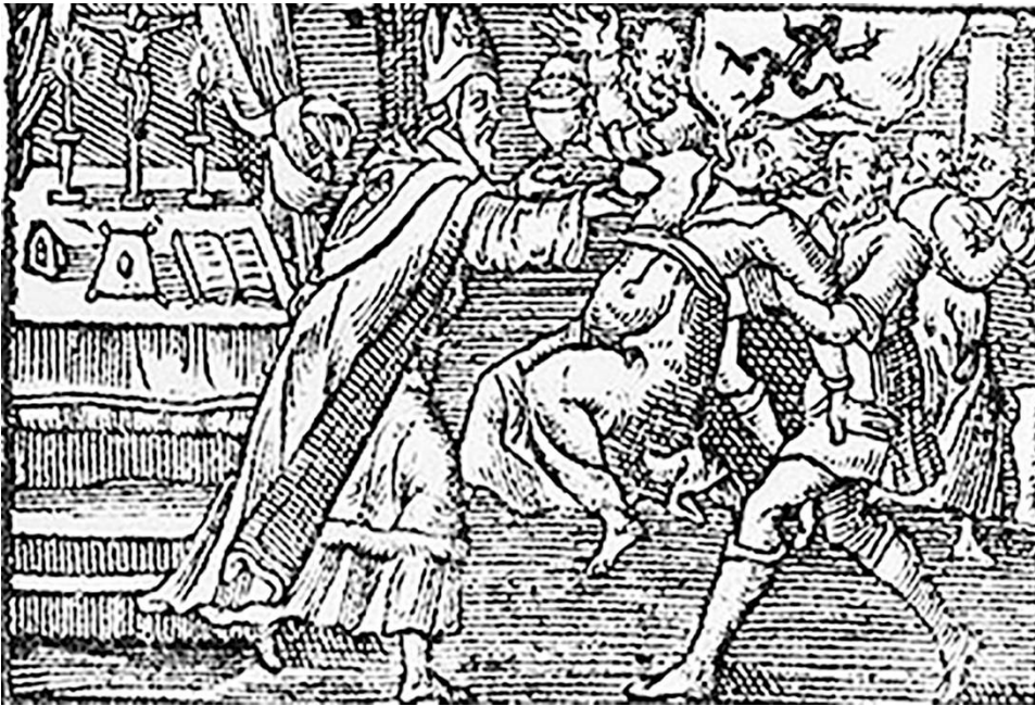
CH01-02: Exorcism of a Witch , 1598. This image is of a demon being exorcised from a woman in front of what appears to be an altar and the bishop.

though exorcism occurs when a demon is commanded by a priest, in the name of God, to stop his activity within a person (Baglio, 2010). This official rite of the Catholic Church began with early religious practices as a remedy for demonic possession. Scripture shows that four of Christ's miracles concern the casting out of demons. Exorcism to expel evil demons may still be one the most widely held religious beliefs in the world (Mercer, 2013).