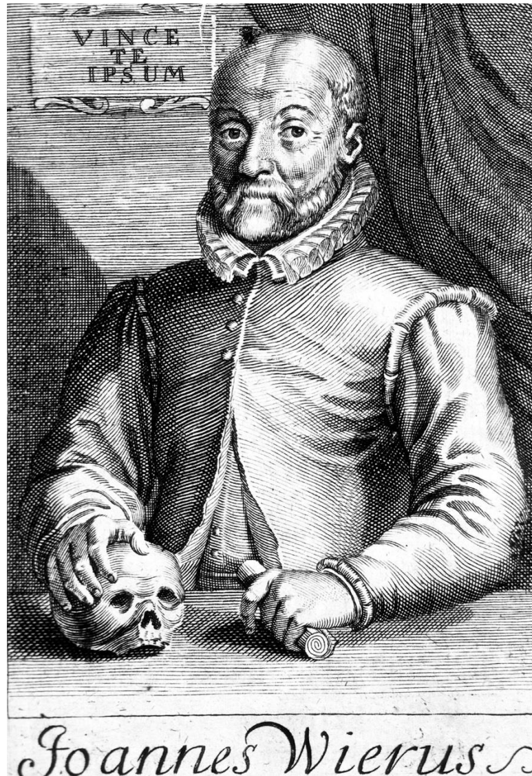
CH01-03: Johannes Wierus. Johann Weyer (1515–1588) is depicted in this engraving holding a scroll in his left hand and a skull in his right hand. In the background is a plaque that reads “Vince Te Ipsum”.. Conquer Thyself.