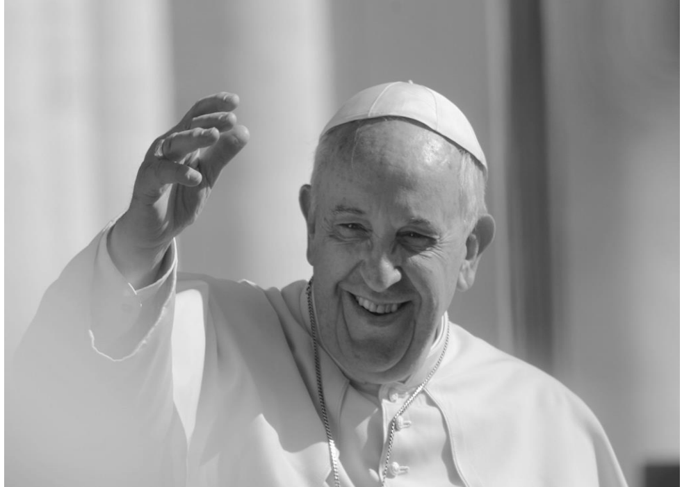
CH01-06: Exorcism has recently been sanctioned as official Catholic practice by Pope Francis. The move came as the result of renewed interest in the practice.

the United States (Mercer, 2013). Upwards of 64 percent of the diverse American Latino population identifies as Pentecostal (Espinosa, 2014).