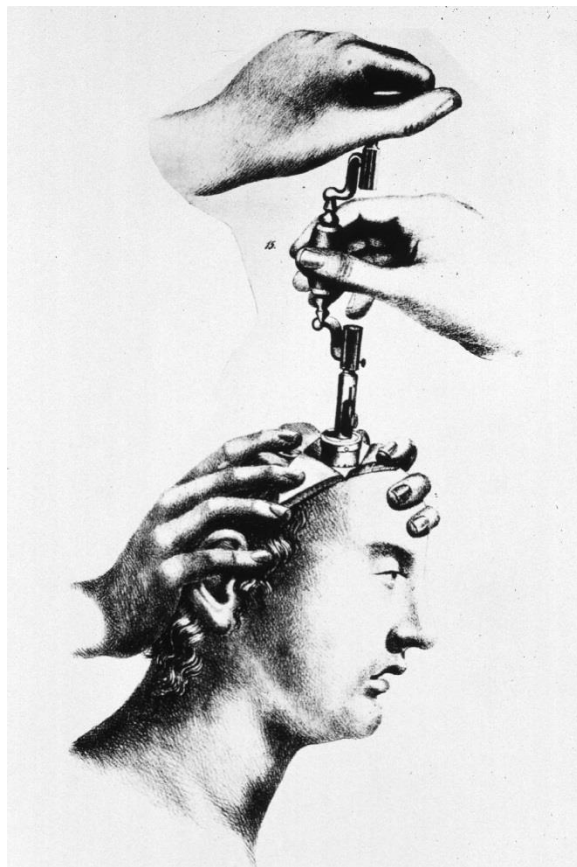
CH01-01: Trephination . The lithograph demonstrates the use of trephining instruments on a man's head.

In Peru, ancient trephined skulls dating back 2300 years have been unearthed. From excavations of these prehistoric skulls, evidence of bone healing suggests that as many as 70 percent of the subjects initially survived the surgery (Rifkinson-Mann, 1988). Medical instruments discovered in Greece and Rome confirm that surgeons continued the practices of perforating the cranium between 25 BC–AD 216 (Faria, 2013). It is well known that ancient people who committed a crime were considered mentally ill. They were treated like outcasts, tortured, or killed. We can assume that criminals were among those treated for the release of evil spirits.